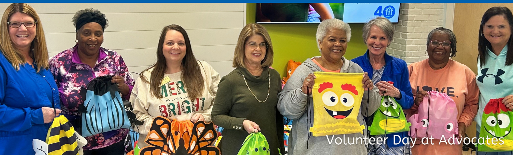
Volunteer Day at Advocates