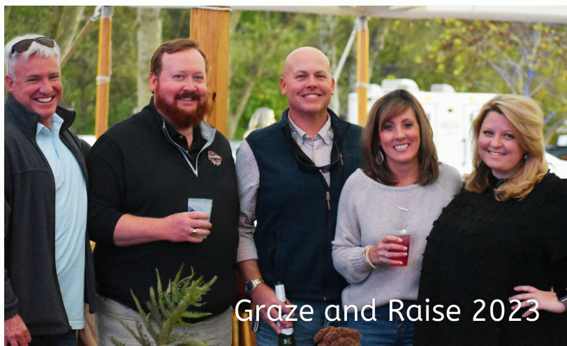
Graze and Raise 2023