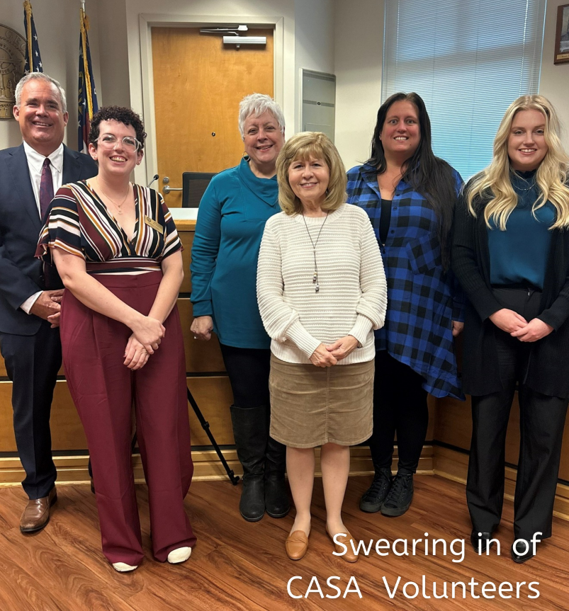
Swearing in of CASA Volunteers