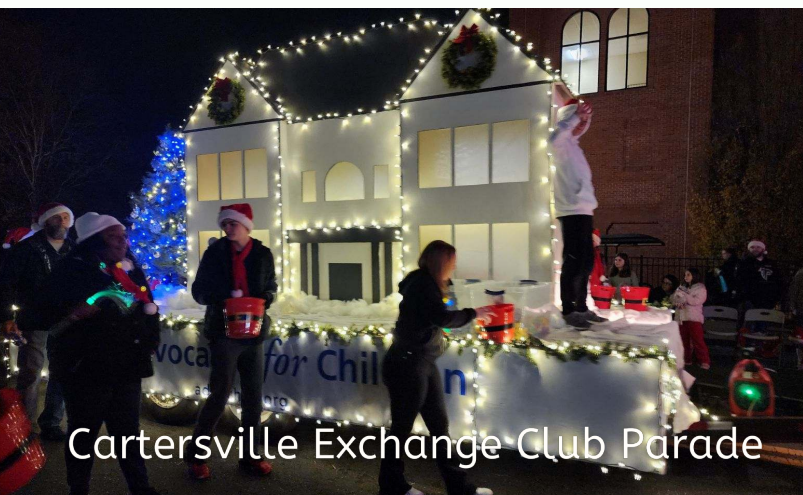
Cartersville Exchange Club Parade