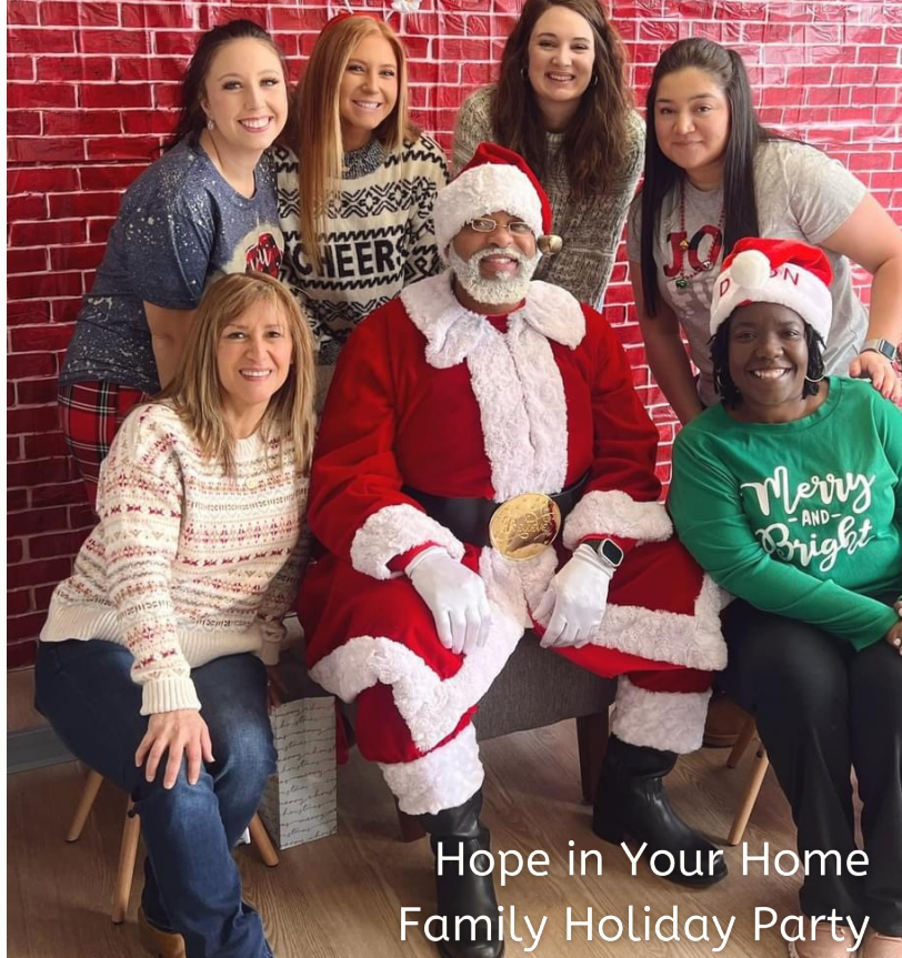
Hope in Your Home Family Holiday Party