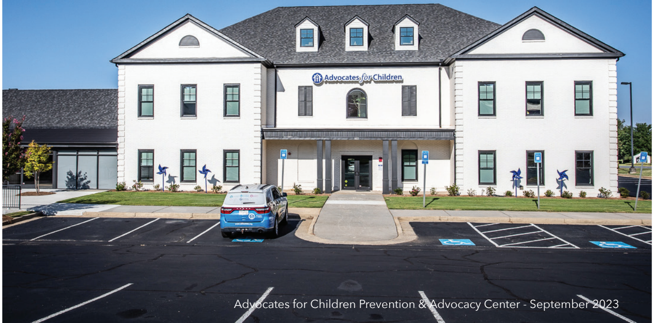
Advocates for Children Prevention & Advocacy Center - September 2023